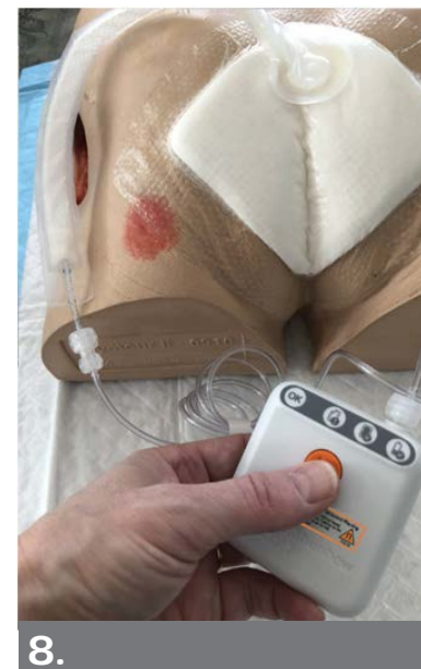
8. Start the therapy by pressing the orange button. Place your hand on the dressing to facilitate the dressing's contraction.