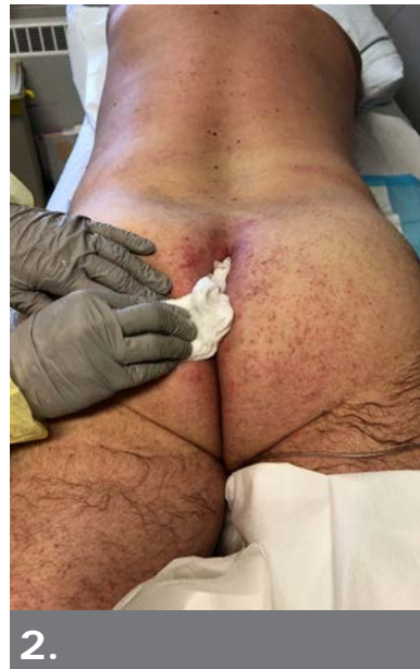
2. Dry the periwound area and allow to completely air dry prior to dressing application. **Residual moisture will impact the ability to achieve an airtight seal