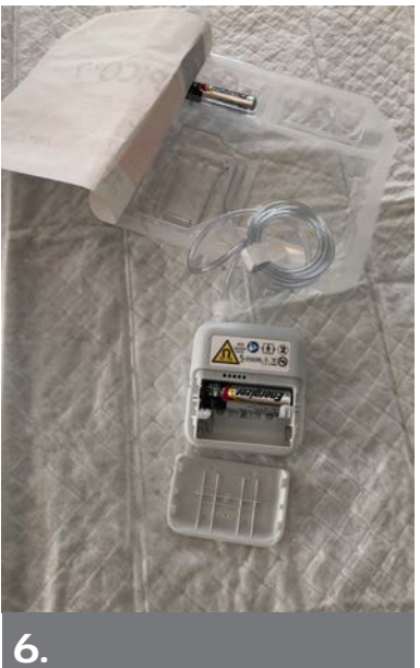
6. Insert the batteries into the pump.