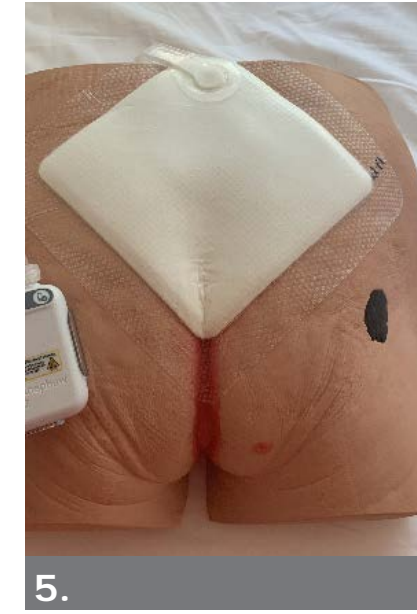
5. Fold the dressing in half and position over the wound. Remove backing to expose adhesive and apply starting on one side, then the center, and then the other side. This technique will help to achieve the best seal. The soft-port should be oriented toward the patient's head.