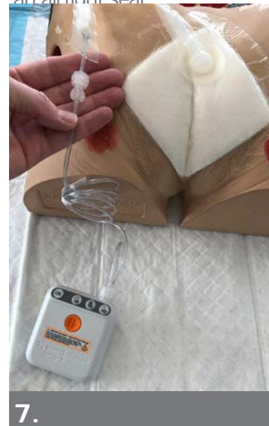
7. Connect the tubing of the device to the suction port of the dressing.