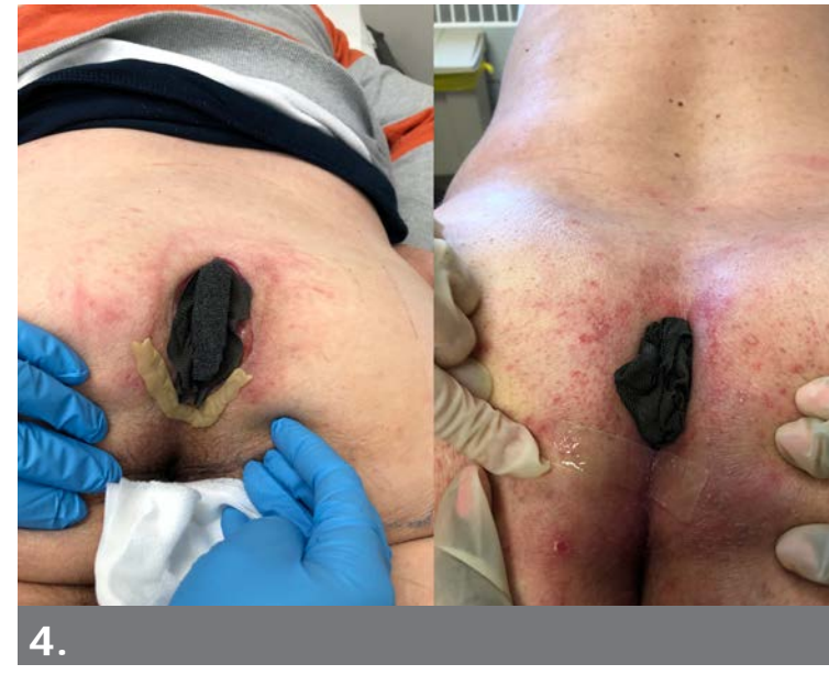
4. Apply stoma paste or gel patch, such as RENASYS ® Gel Patch, below the wound/incision in order to improve seal for the negative pressure. Ensure that the dressing is in contact with the skin in the intra-gluteal fold.