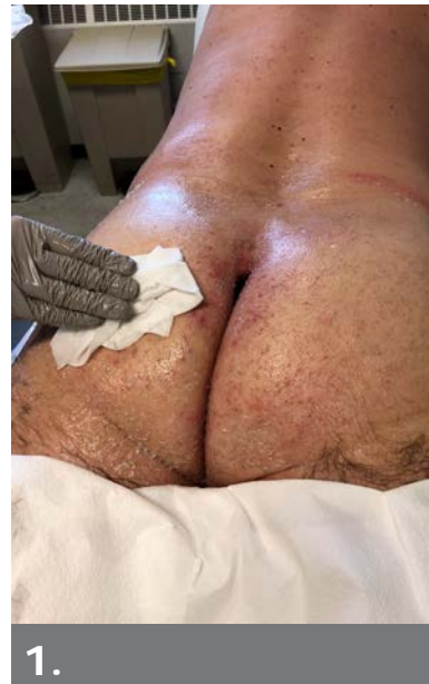
1. Remove any excess hair. Cleanse the wound and periwound skin well according to institution protocol.

PICO ® 7 Single Use Negative Pressure Wound Therapy System